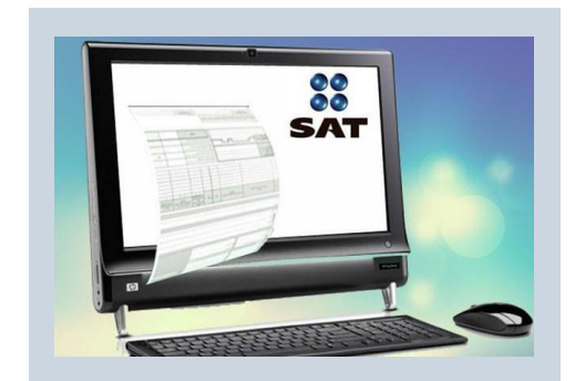
Obligation to keep records and accounting entries through electronic means

Electronic accounting refers to the obligation to keep records and accounting entries through electronic means and enter a monthly basis their accounting information via the website of the SAT.